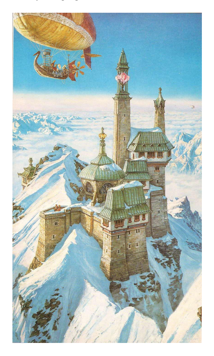
Sky monastery of Reaching Moon and a tepinna ship.

[See Thantier essay for more details on the Sky people.]